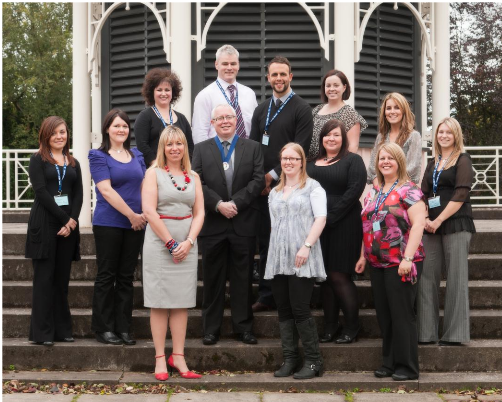
Above : September 2011 – student success recognised at the IRRV Scottish Conference in Crieff.