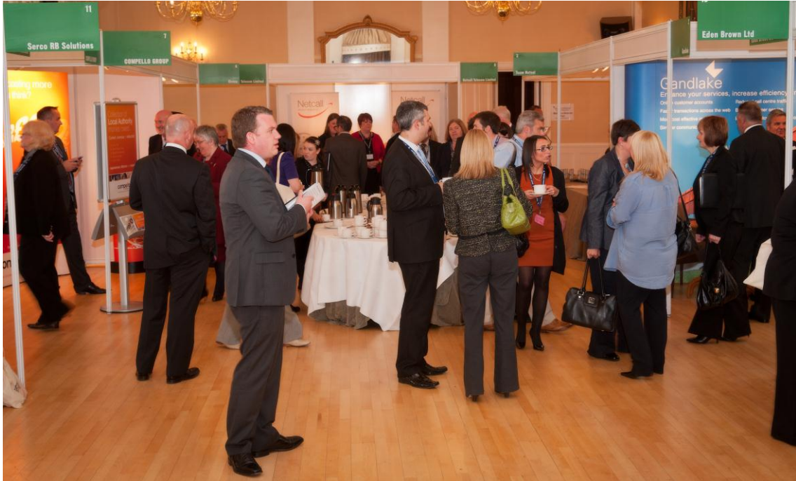
Above : The busy Scottish Conference 2011 exhibition.

Here's some photographs from the event :