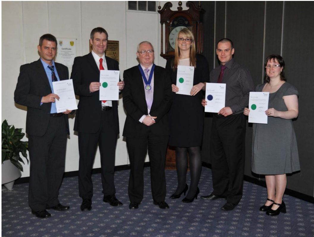
Above : February 2011 – student success recognised at the IRRV Scottish Association’s AGM in Falkirk.

IRRV Scotland is delighted to recognise the success of the many Institute students in Scotland who have passed their Institute qualifications.